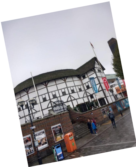
The GLOBE Theatre