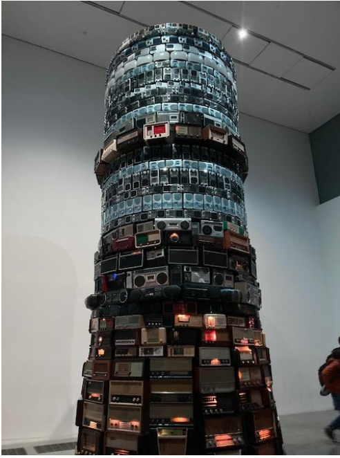
The Tate Modern in London

It is a huge popular museum in London: It is all about contemporary art. You could see different pieces of art like this radio tower. By EBM