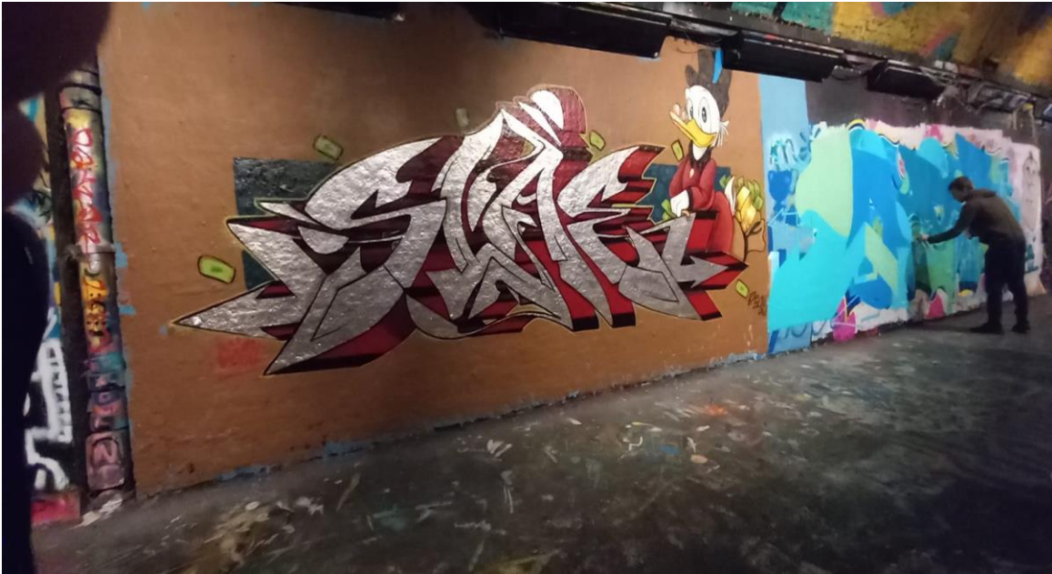
Street Art in London

It is the big wheel in the Centre of London. We walked past it and I took photos. It is one of my three favourite places we saw in England because it is magnificent and And stunning. by VV